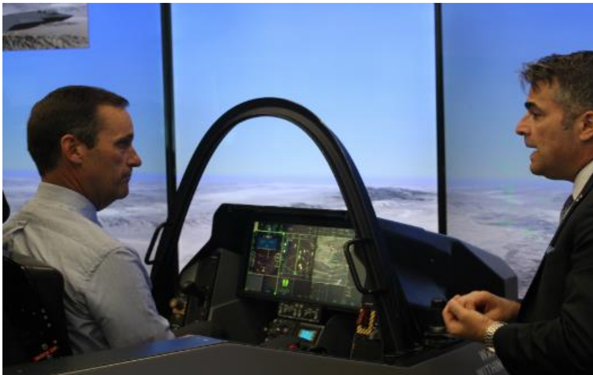
Rep. Steve Knight (CA-25) receives a personalized demonstration in the F-35 cockpit simulator.