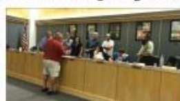
The Castaic Area Town Council listens to a man during its Aug. 15 meeting. The Tapia Ranch project, which the council supports, is a total of 1,200 acres with about 900 acres to be preserved as undeveloped open space.